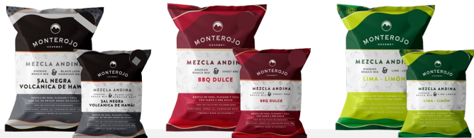
Black Volcanic Hawaiian Salt Andean Mix 110 g – 30 g