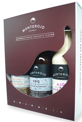
3 Pack 495 g