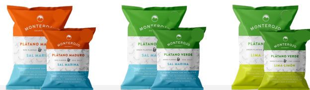
Sea Salt Sweet Plantain Chips 120 g – 30 g

Irresistible crunchy chips of thick and rustic potatoes, green plantains and yuccas with different flavor combinations characterized by their unique and natural touch.