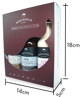
Pack x 3 assorted units

24 individual units of the same flavor per master case