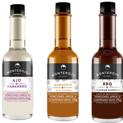
Individual size 165 g each