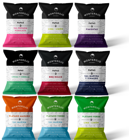
Small Individual Units (25g-30g)