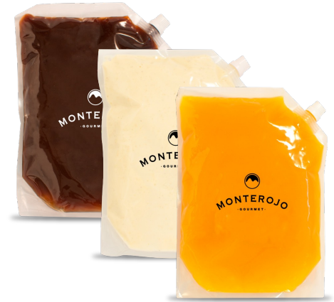
Presentation per kilo each